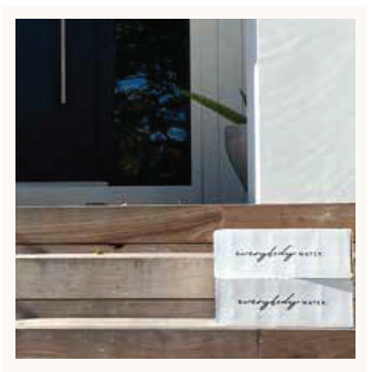
12 x 16.9oz/500ml case