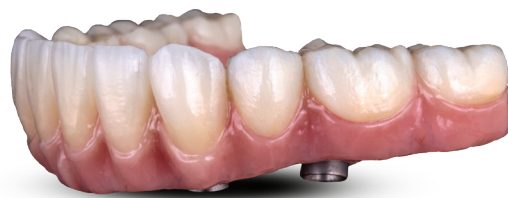
Fabricated by Oral Arts Technicians