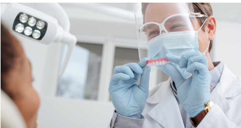
SAFETY SUPPLIES & PPE