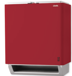
PAPER TOWEL DISPENSERS