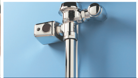
AUTOMATIC FLUSH DEVICES