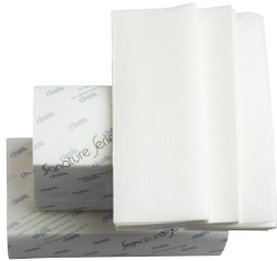
Z-FOLD PAPER TOWELS