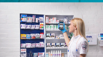
FIRST AID & PPE