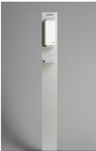
DISPENSERS & STANDS

Provide peace of mind with touchless restroom dispensers.