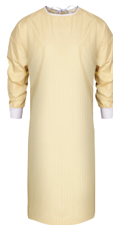
NON-SURGICAL ISOLATION GOWNS

Many dental offices are taking additional steps to help protect their staff, residents and visitors with our non-surgical isolation gown services and rental face mask — which includes laundering and delivery.