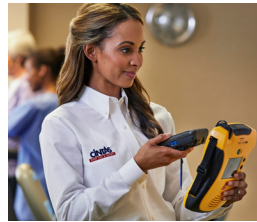
AEDs for Lay Responders