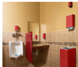
Signature Series® Restroom Dispensers