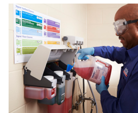
Signet® Cleaning Chemical Service