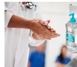
Hand Sanitizer Service