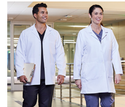
WonderWink® White Coats