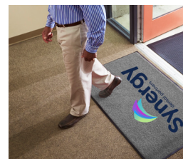
Mat Services/Logo Mat