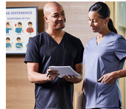
Landau® CareFlex® Scrub Rental