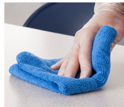
Healthcare Grade Microfiber Mops and Wipers Service