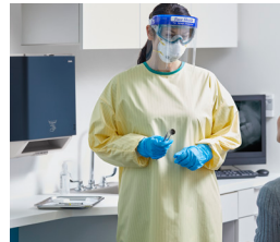
Non-Surgical Isolation Gowns*