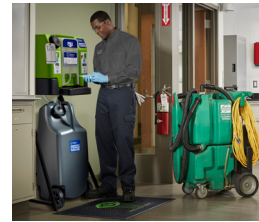
Emergency Eyewash Stations