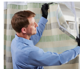
Privacy Curtain Service