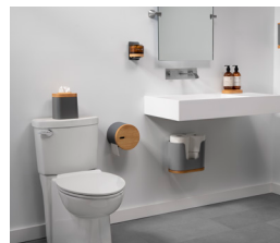
Branch & Vine® Restroom Supplies