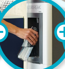
HANDS FREE WATERBREAK®