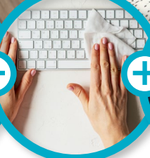
SANITIZER/ DISINFECTANT WIPES