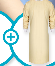
REUSABLE NON-SURGICAL ISOLATION GOWNS

Contact Kasi Ostenkamp at 513.972.3410 or OstenkampK@cintas.com