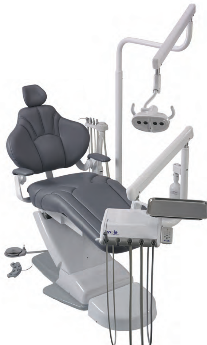
Wide Back E300 Chair Twin Stitch Upholstery *Optional upgrades shown