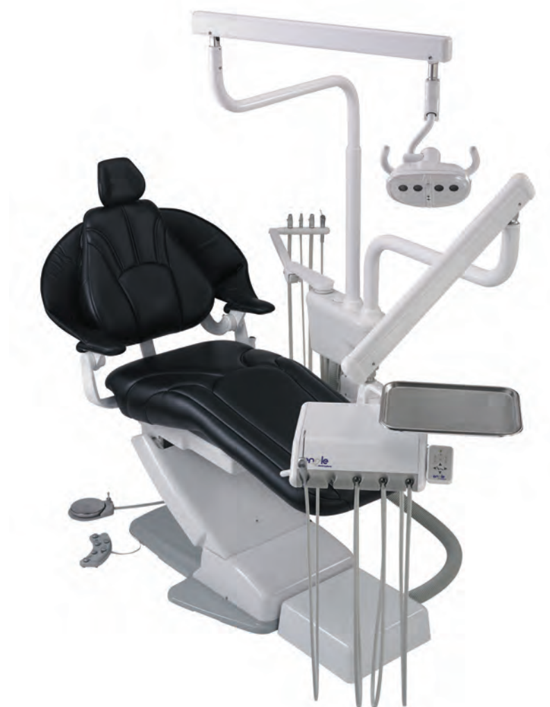
E300 Narrow Back Chair w/ Slings Twin Stitch Upholstery *Optional upgrades shown