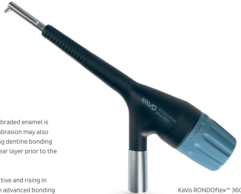
KaVo RONDOflex™ 360

Whilst air abrasion is clinically very effective and rising in popularity with clinicians who work with advanced bonding situations, one of its major drawbacks has been the mess associated with the procedure. Intraoral air abrasion results in the scattering of the used microscopic alumina particles throughout the mouth, as well as out and onto the patient's face, and often all over the immediate clinical working environment. This can include the Dentist's gloves, the floor and even the working benchtops in the clinical setting.