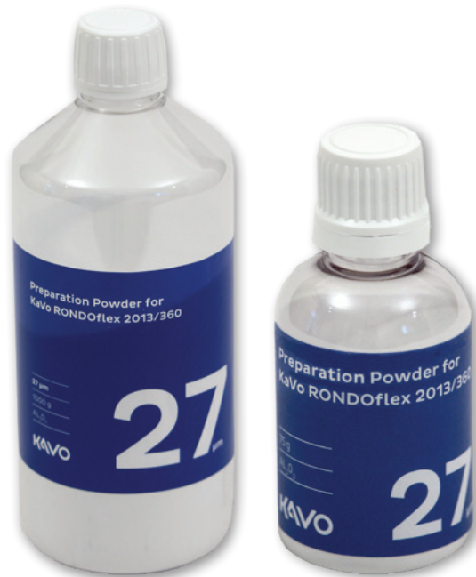
Corundum powder for KaVo RONDOflex™ 360, 27 µm grade for lower abrasive power.

The pressure-sprayed alumina particles are well contained within the water spray and are not scattered throughout the mouth or clinical working space.