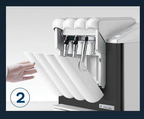
Close the door